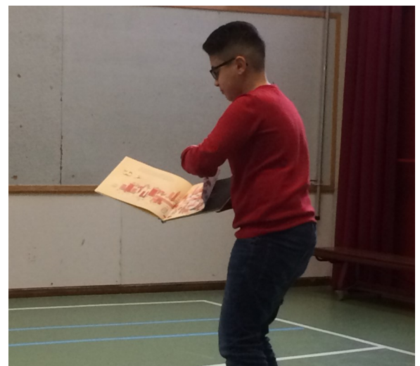
Lauend—Reading Aloud winner