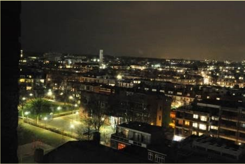
KSS at night time in ID1